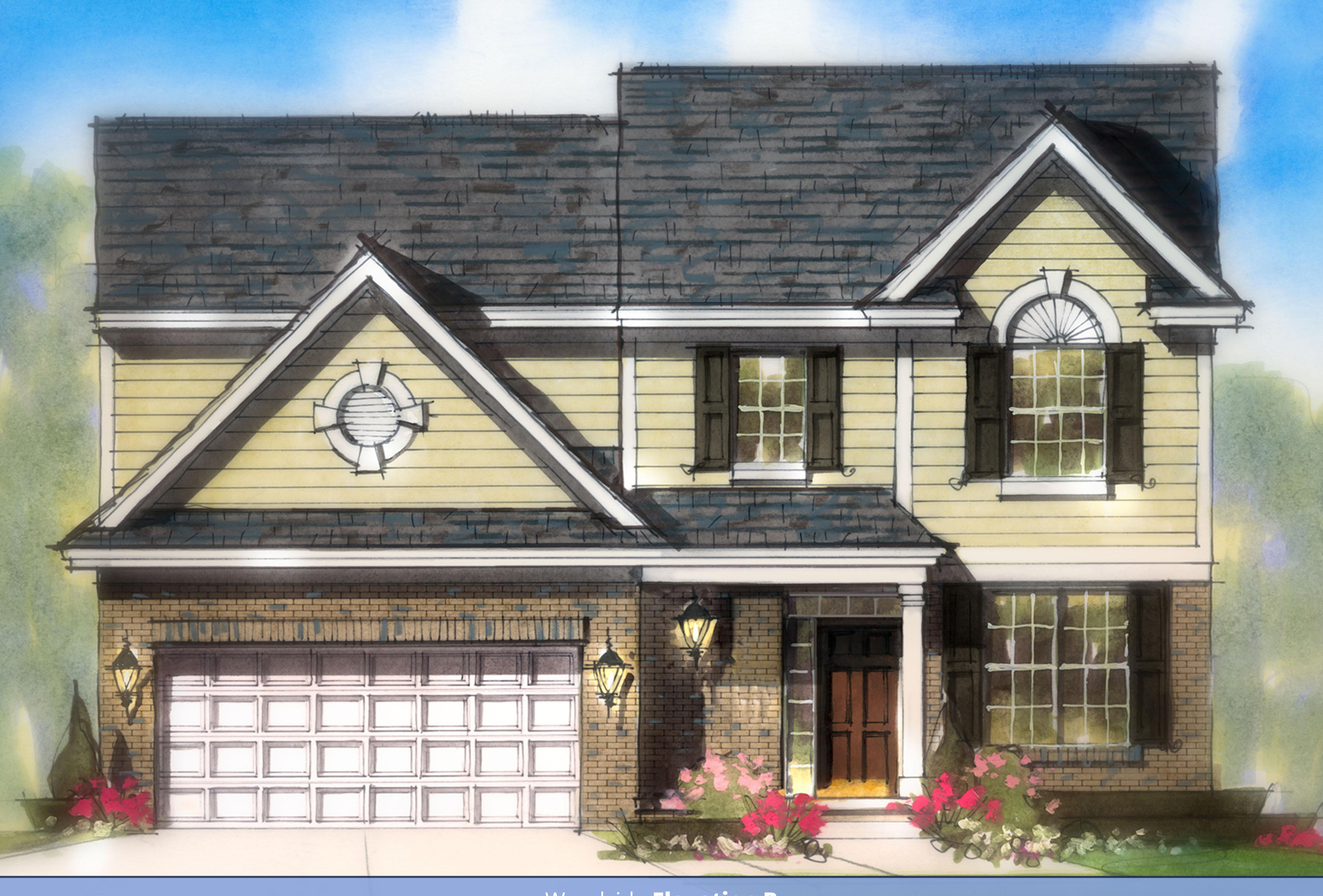
Woodside Elevation B