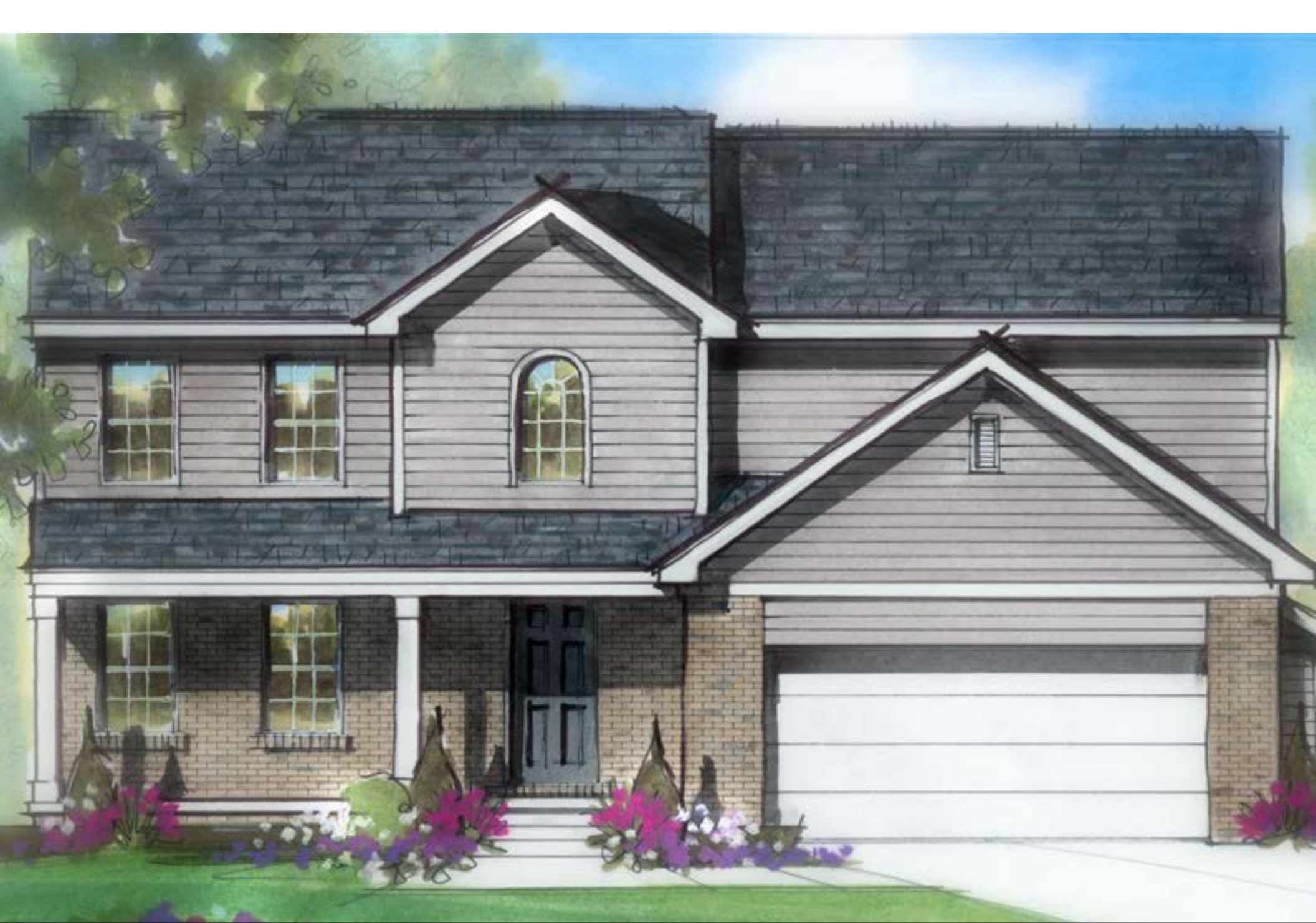
Bayport Elevation A