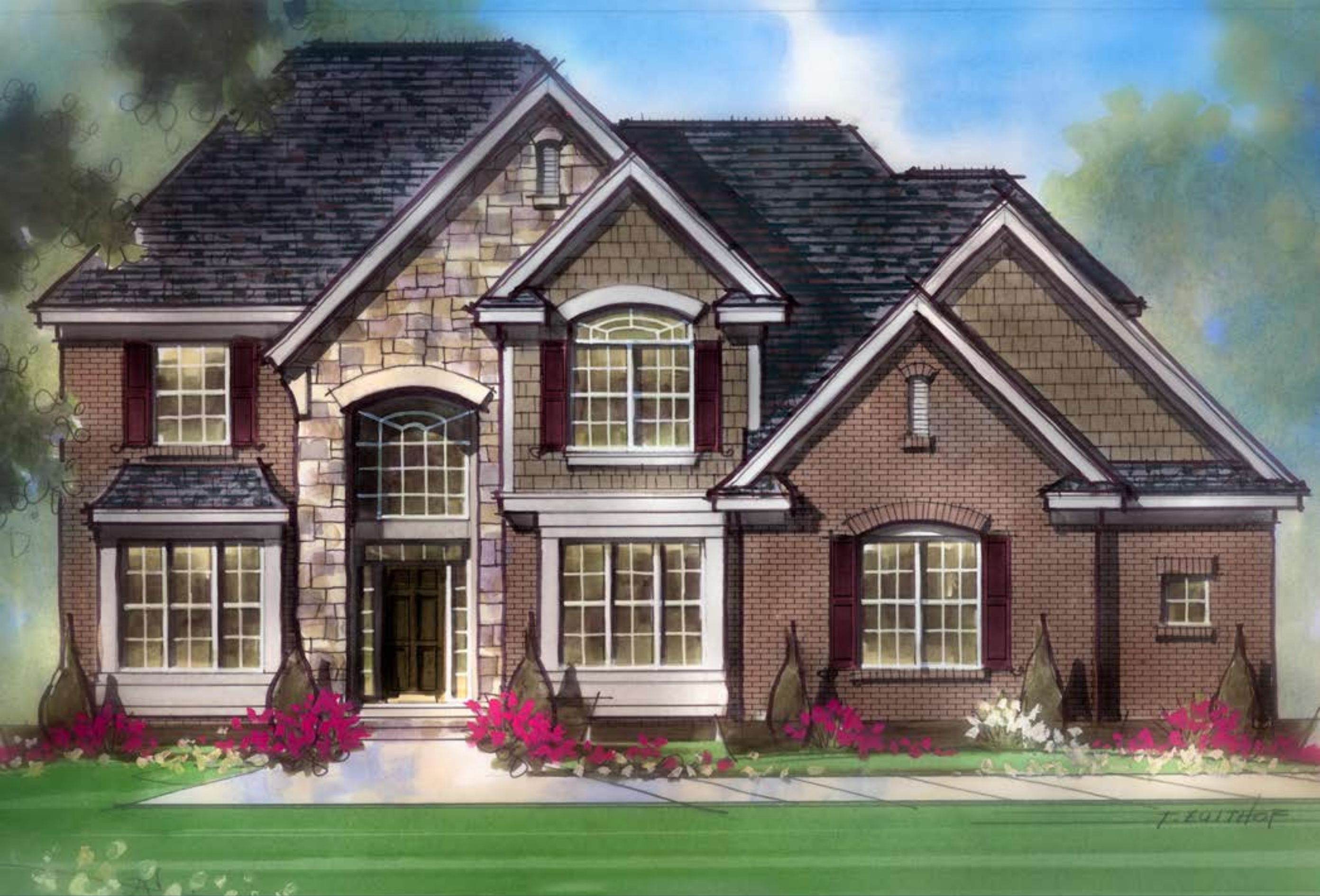
Wooddale Elevation C