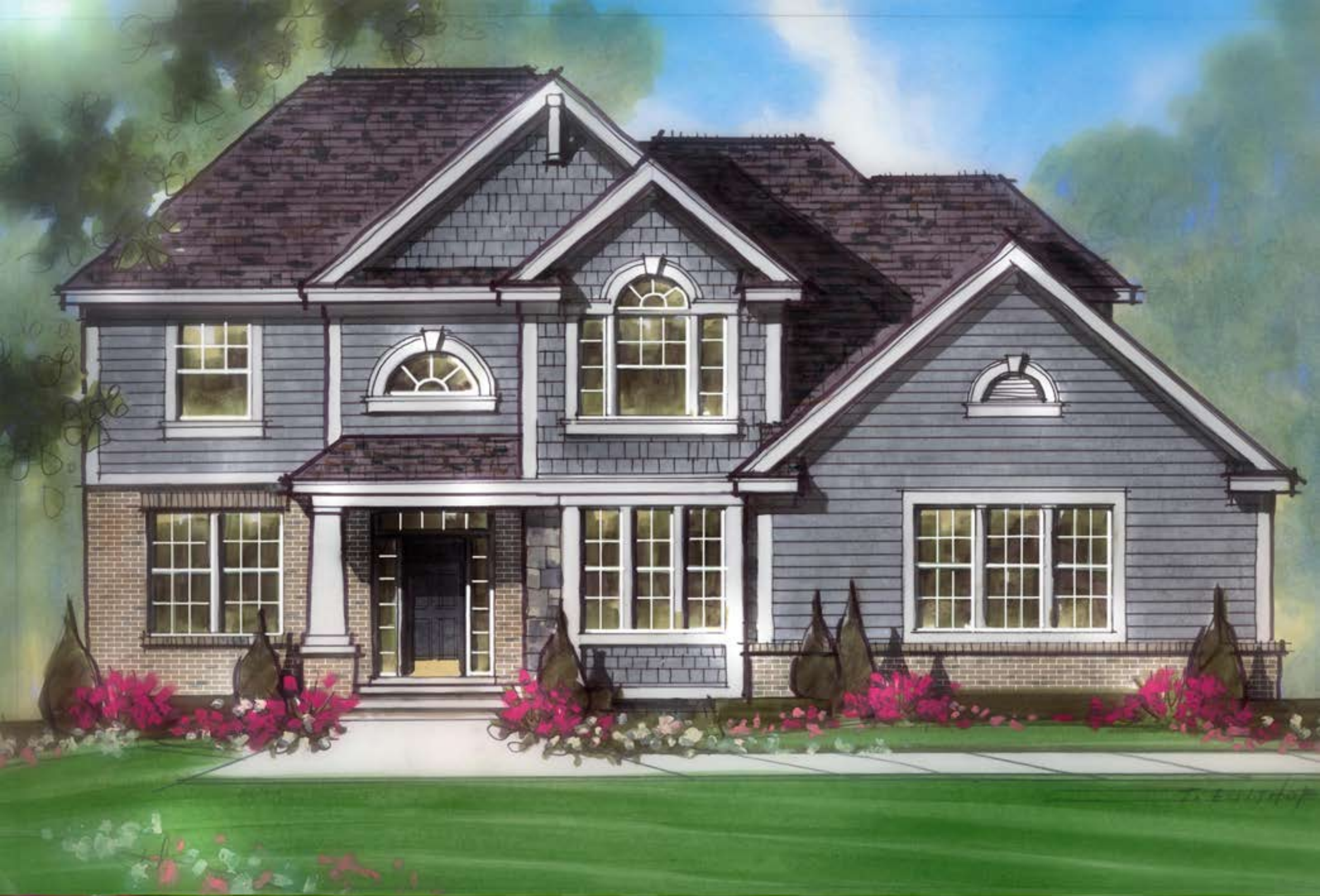
Wooddale Elevation A